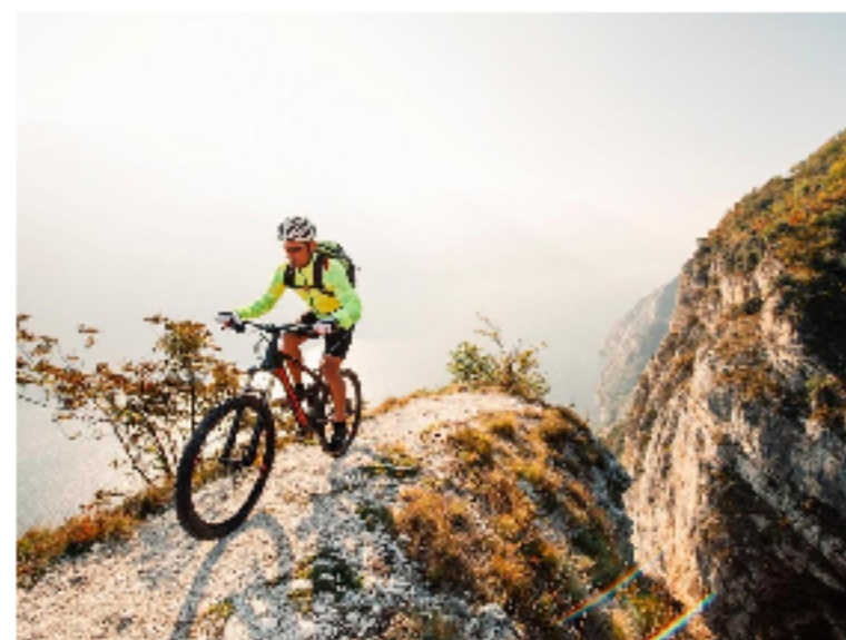
go mountain biking